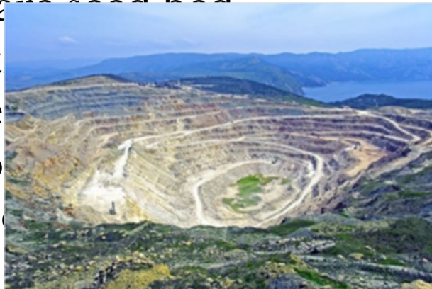
The Environmental Problems Caused by Mining

Mining operations have large repercussions on the local surroundings as well as wider implications for the environmental health of the planet.